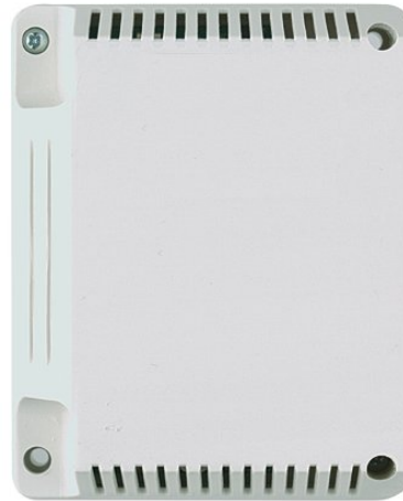
GHU Room / Duct

Combined temperature and humidity controller with display